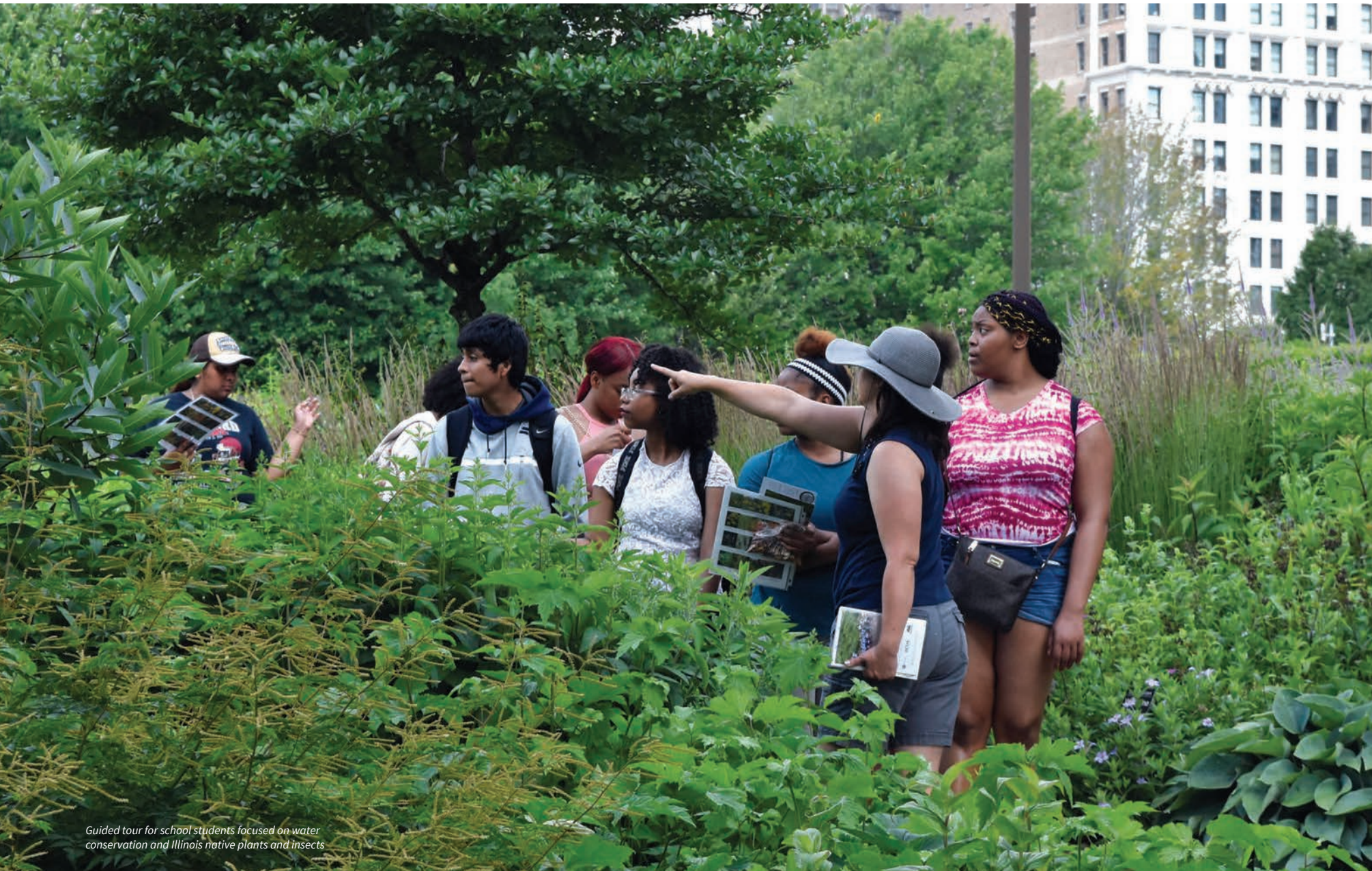
Guided tour for school students focused on water conservation and Illinois native plants and insects