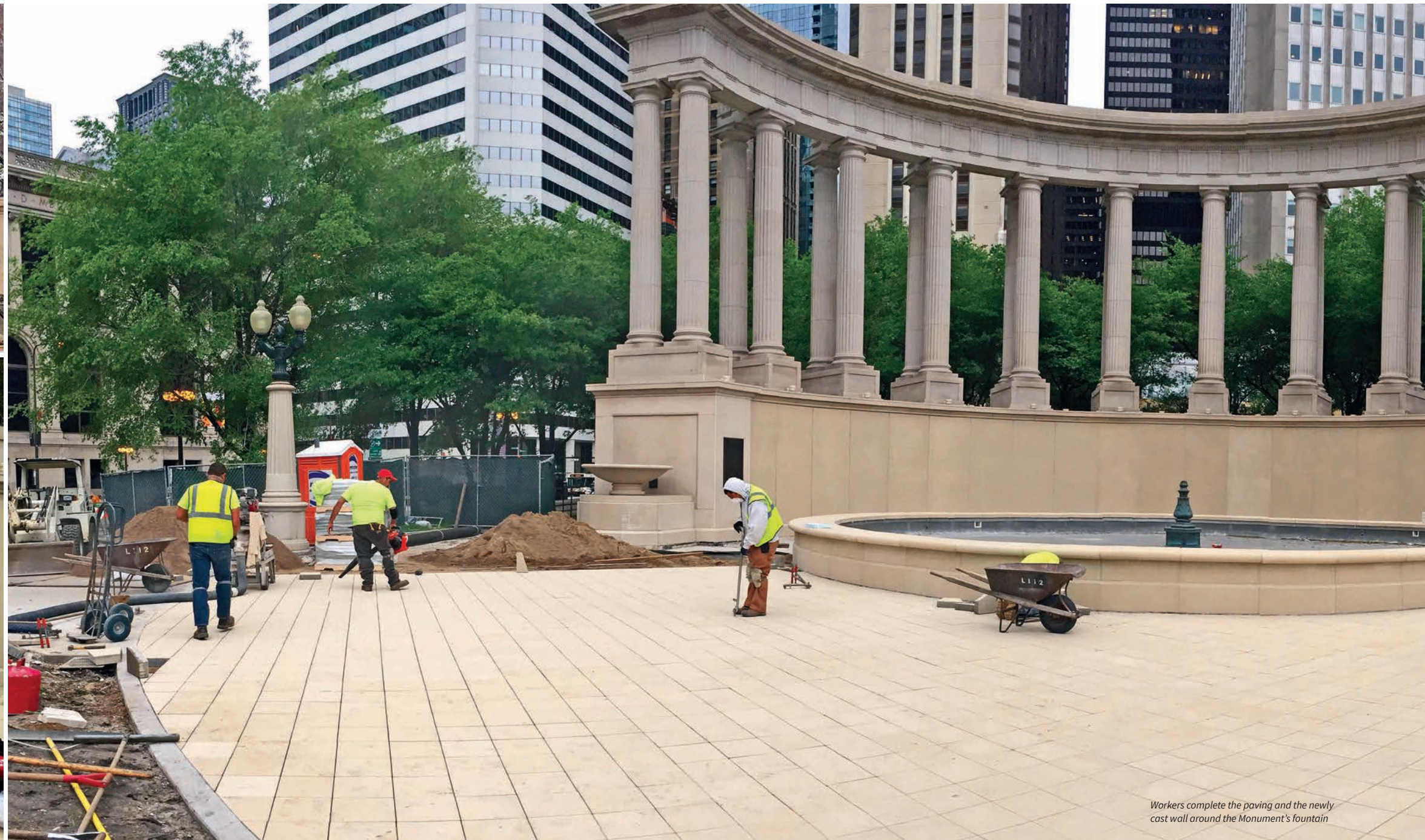
Workers complete the paving and the newly cast wall around the Monument's fountain