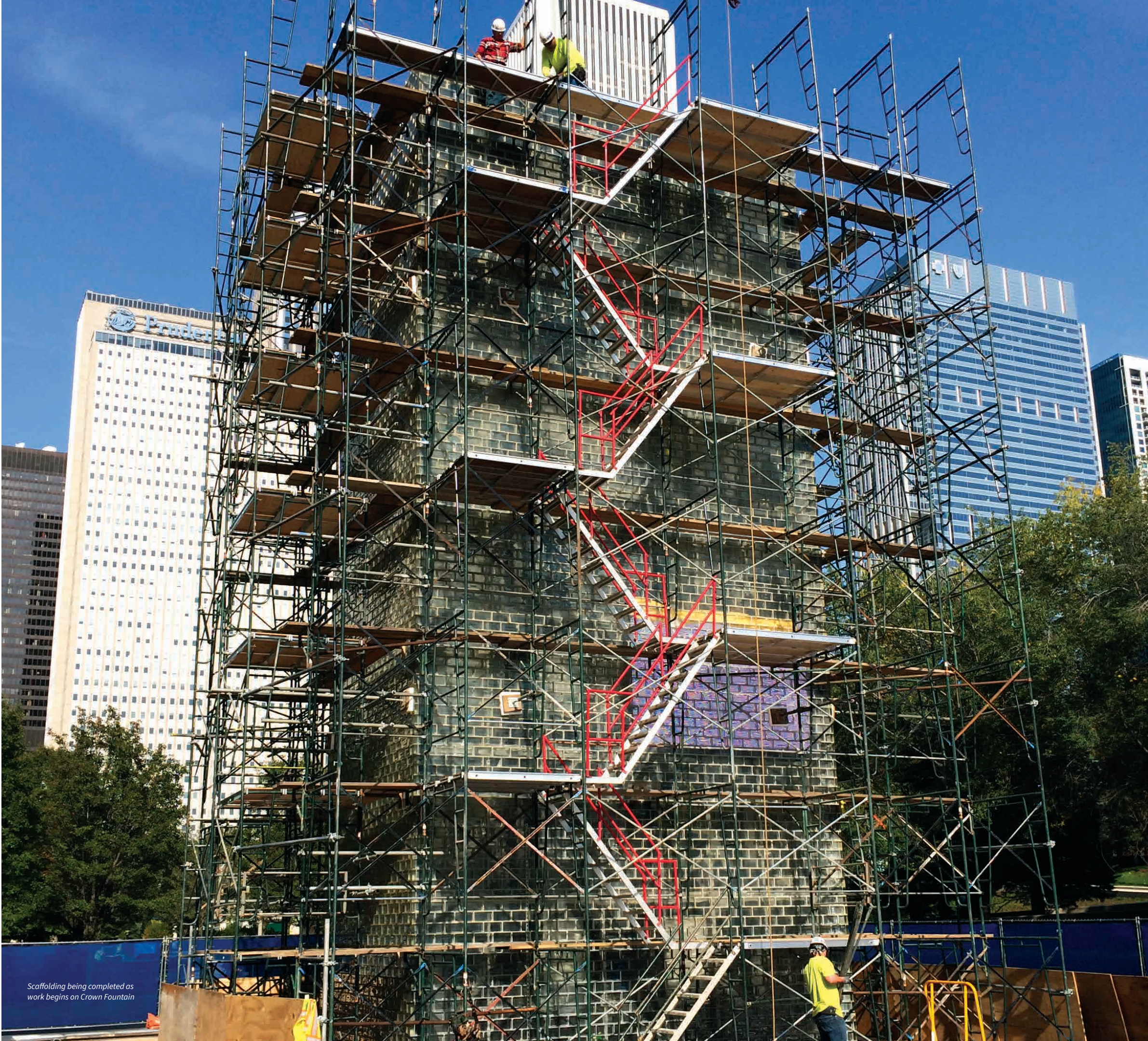
Scaffolding being completed as work begins on Crown Fountain

The restoration was overseen by a partnership comprised of the Millennium Park Foundation, the Crown family, Jaime Plensa, and DCASE.