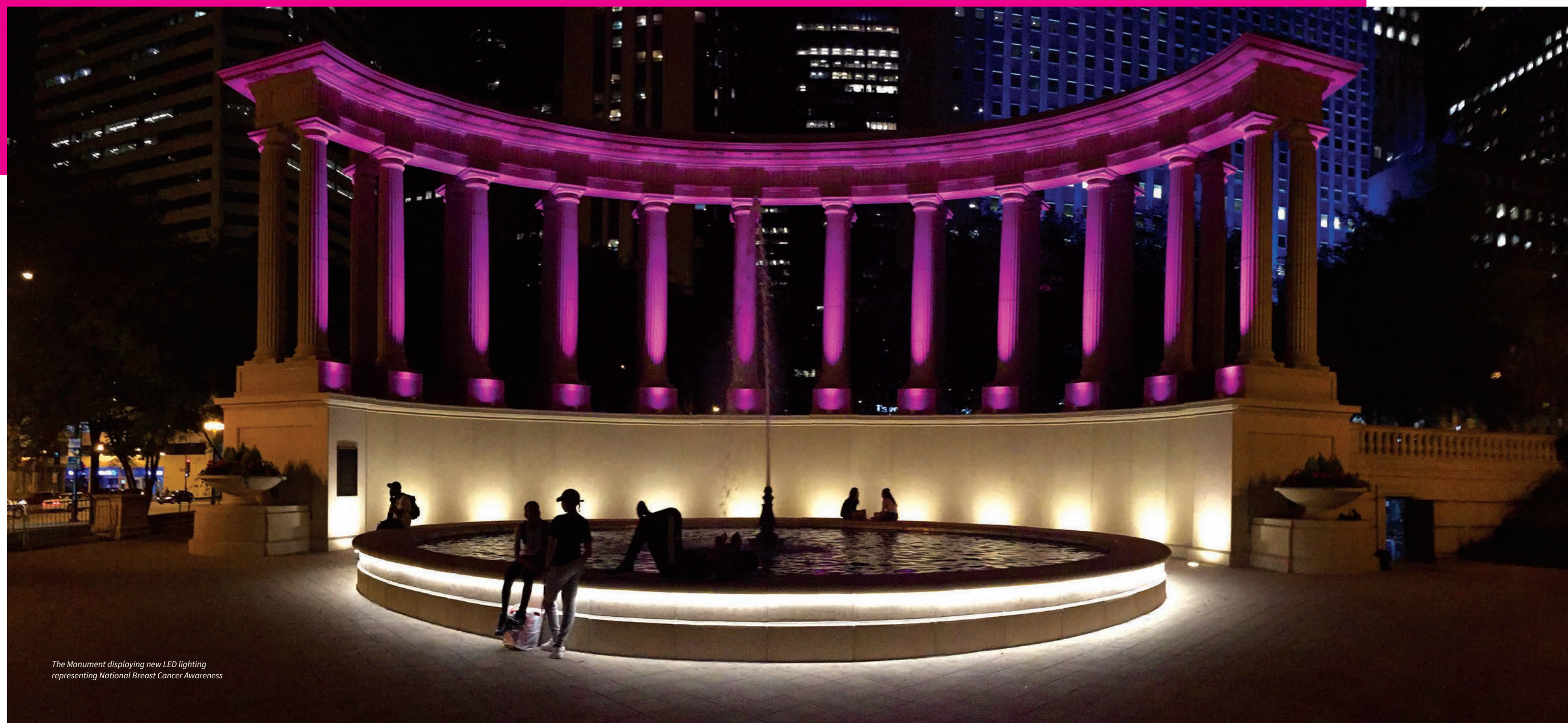
The Monument displaying new LED lighting representing National Breast Cancer Awareness

The Millennium Monument at Wrigley Square is known for its classic Doric-style columns and is the location where all 124 Founders of Millennium Park are recognized. As the anchor of the most-traveled corner of the Park over the past 14 years, the Monument required maintenance. Through the generosity of our Founders, Millennium Park Foundation was able to restore and improve the Millennium Monument as a classic cornerstone to the art and architecture of the Millennium Park experience. This restoration also allows the names of our newest Founders to be added to the Founders Wall. These names will be engraved in the fall of 2018.